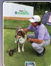
Phil Mickelson and Belfair