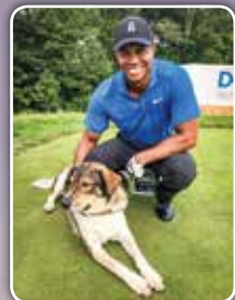
Tiger Woods and Belfair