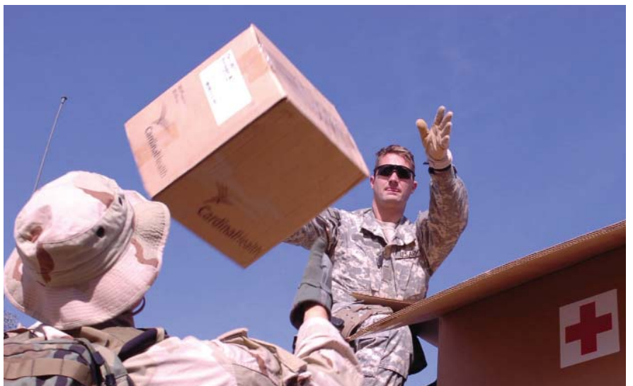
U.S. Army special operations medical personnel unload medical supplies during a U.S. Iraqi medical civil-military operation in Ash Sharqat, Iraq. The operation brought U.S. military medical providers together with Iraqi doctors to provide free medical care.

“These are key operations for us to conduct in order to give that positive presence Special Forces has had throughout the world for decades now,” he said.