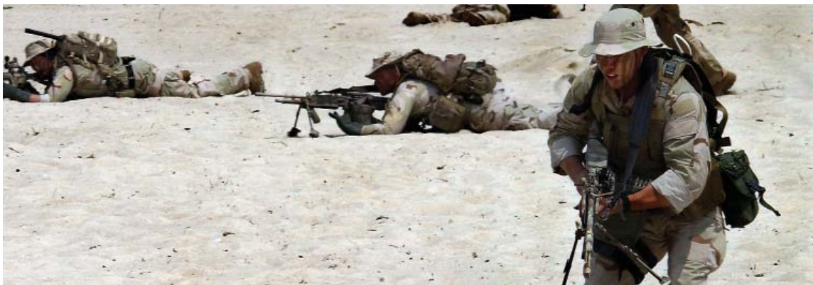
SEALs demonstrate small unit tactics.

The mission statement continues, "While maintaining the offensive in the Global War on Terrorism, we will simultaneously seek to transform the command into an organization that continues to leverage every possible advantage." SOF training and exercises are undergoing constant improvements, and the command looks to the DODs training transformation effort as a prime opportunity to demonstrate its current level of readiness and as a place to hone or test new concepts. How to transform — how to identify and develop those capabilities SOF will need to be a useful part of the future joint team while maintaining the readiness to shape and respond to the world today — is a significant linchpin. Methodically and intentionally looking to the future through various lenses will better position USSOCOM to carry out its lead role in the war on terrorism and its Service-like responsibilities to man, equip, and train special operations. More importantly, it will lead to SOF warriors with stronger capabilities, better warfighting concepts, and improved joint operational skills that serve the combatant commanders and the Nation.