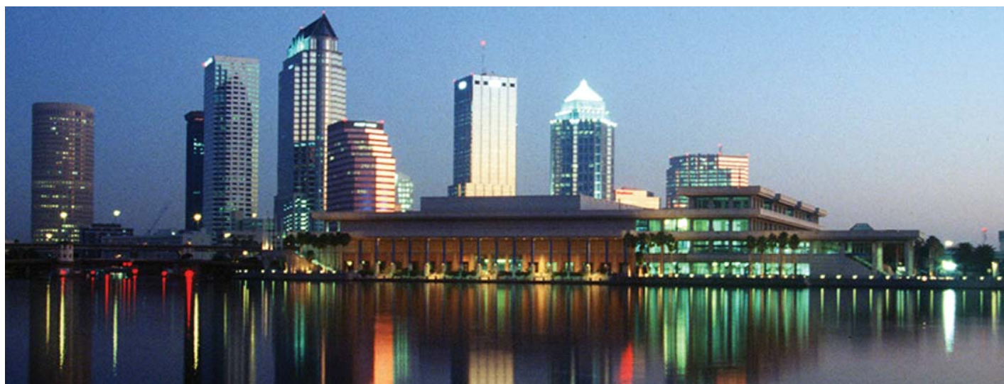
A view of the Tampa Convention Center.

USSOCOM will not sponsor an APBI in 2007. In 2007, USSOCOM will hold SOF Week in April and the week’s total focus will be the command’s 20th anniversary.