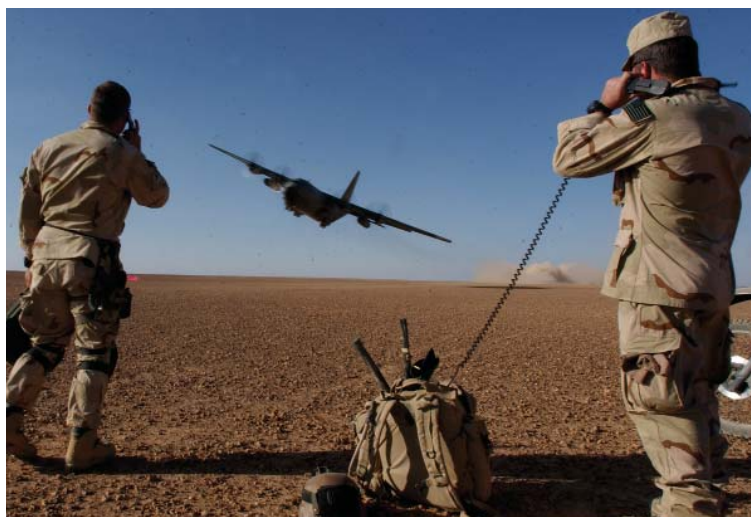
After establishing a runway and clearing air space, Combat Controllers give a C-130 take off clearance while conducting air traffic and control procedures.