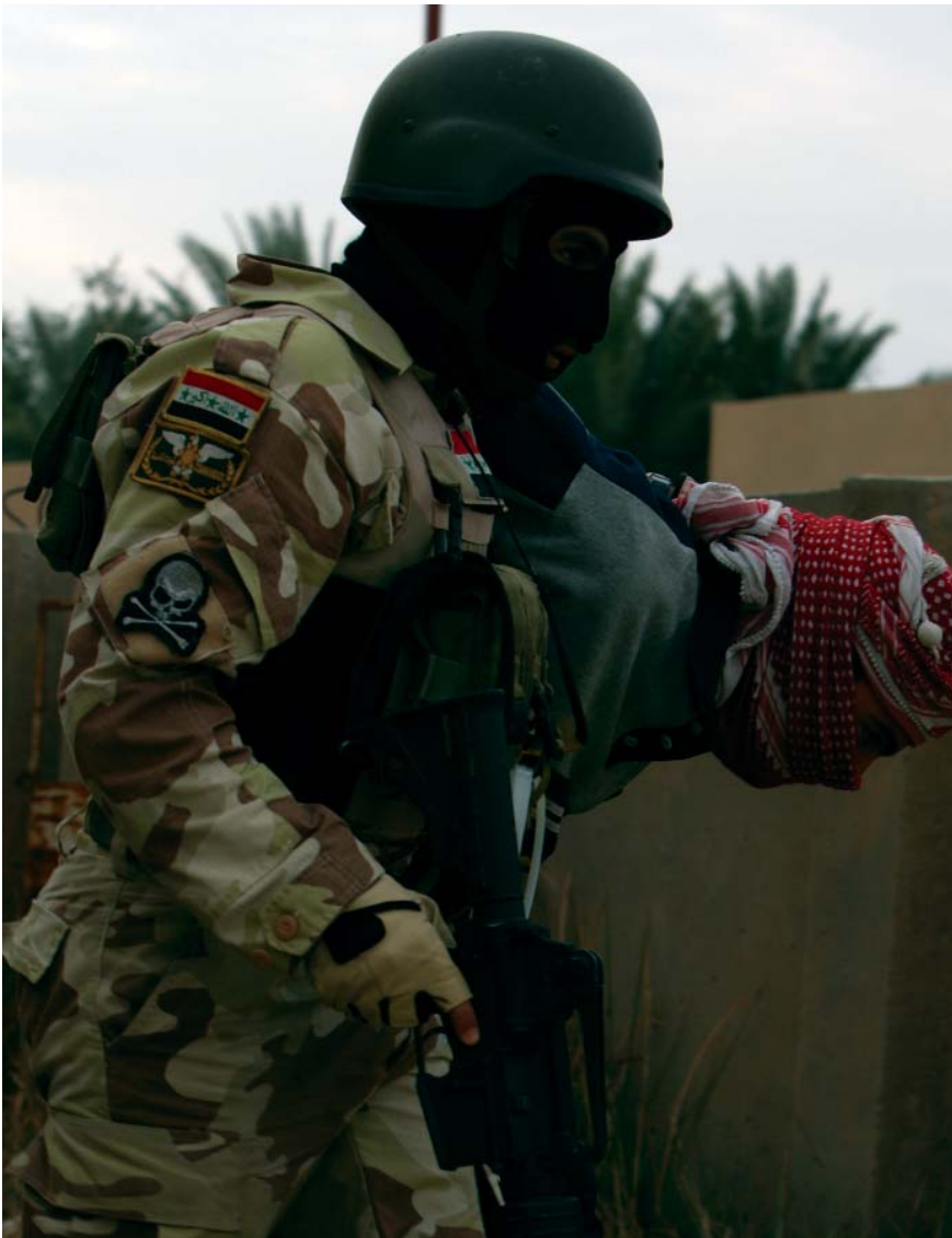
An Iraqi special operation forces soldier escorts a detainee after a recent raid searching for insurgents in Baghdad.

No ISOF soldiers or U.S. forces were killed during the operation. One ISOF soldier was wounded in the