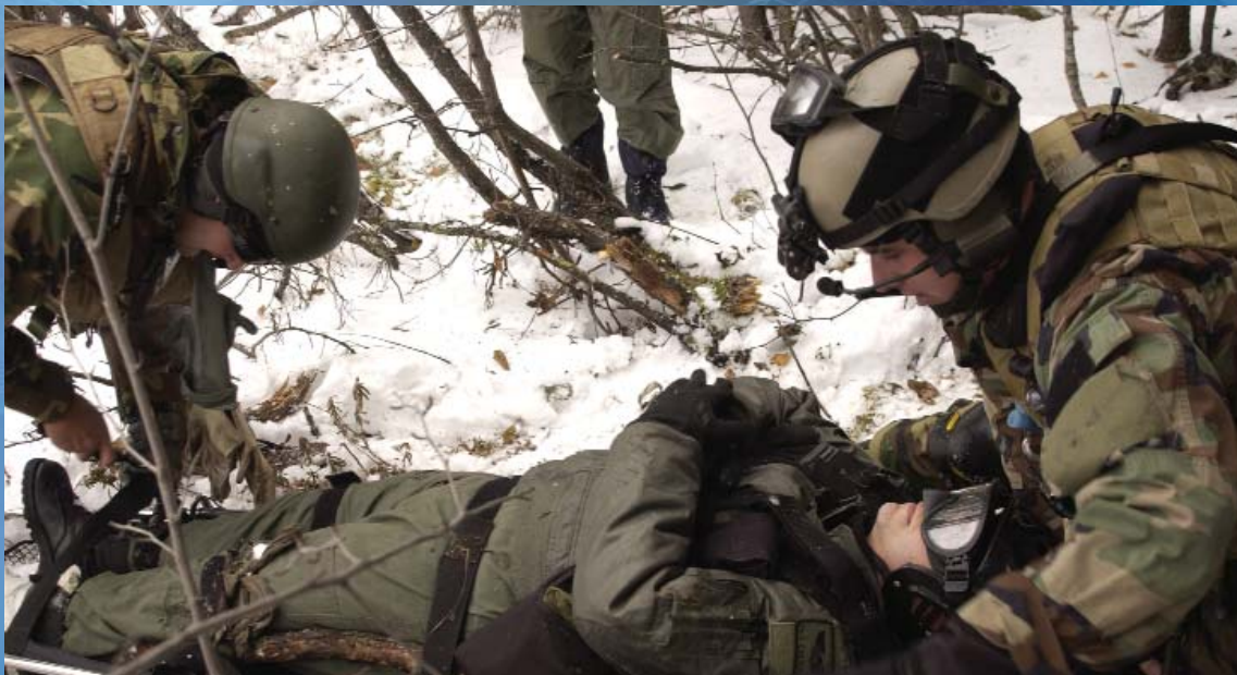
Special operators ensure a rescued pilot is secured to a transport before evacuating to a safe area in a combat search and rescue training during the Cope Thunder exercise at Eielson Air Force Base, Ala., Oct. 18, 2006.

During the care under fire phase, the need for mission personnel to assist in ensuring a successful outcome to the engagement may take priority over immediate medical care. The combat medic may be required to return fire before rendering care in some casualty scenarios. In addition, in the words of a former commanding officer of SEAL Team Four, "I also expect the casualties to continue to return fire as long as they are able to do so." Also during this phase, it is important to try and prevent the casualty and other mission personnel from receiving further injuries. The most important medical consideration of this phase is to control severe extremity hemorrhage with a tourniquet and to stop severe torso hemorrhage with a HemCon