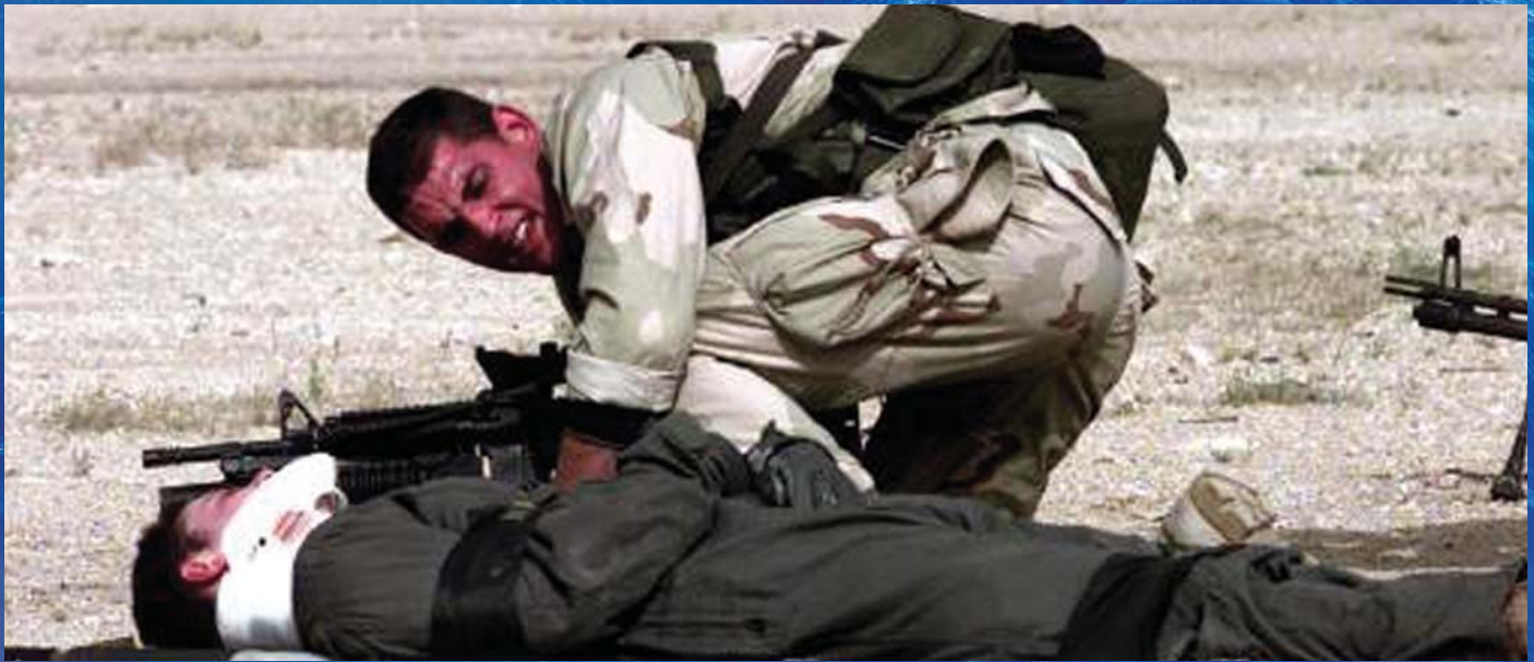
A SEAL medic readies a wounded teammate for evacuation to a medical treatment facility.