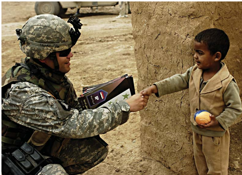
A NCO from the 324th Tactical Psychological Operations Company engages with an Iraqi child during a visit to the village of Hawija.

“We’re just hanging out and showing them we aren’t all bad,” the 324th NCO said.