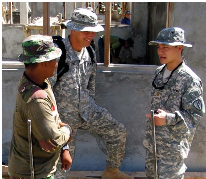
Civil Affairs Planner, right, and CA Team Leader, middle, both with the 96th CA Battalion, Bravo Company, Fort Bragg, N.C., talk with an Indonesian officer in the village of Teluk Dalam on the Indonesian Island of Nias.

According to the U.S. team members, local families had to send their children out to farther schools, placing more stress on them. This project, they say, will turn that around ten-fold.