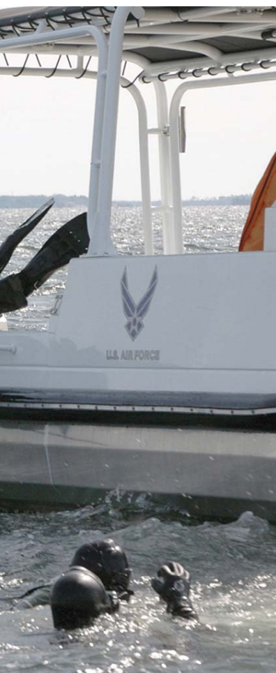
Combat Dive Course students dive backward from their boat into the gulf waters.