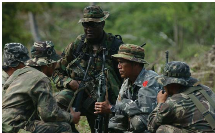
A Special Forces Soldier conducts Security Assistance Training for members of the Armed Forces Philippines. This field training is held on the Zamboanga Peninsula of the Philippine Islands with the Joint Special Operations Task Force Philippines.

Established by Congress in 1987, USSOCOM was envisioned as a unified command with service-like responsibilities to oversee all of SOF. Designated responsibilities outlined in Title 10 of the U.S. Code included resource allocation and budget management, ostensibly to bolster special operations capabilities in such areas as joint doctrine and training, personnel management,