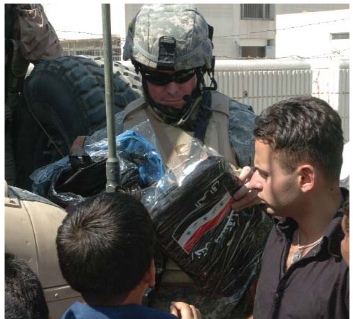
Psychological Operations Soldier hands out book bags to local children in Baghdad, Iraq.