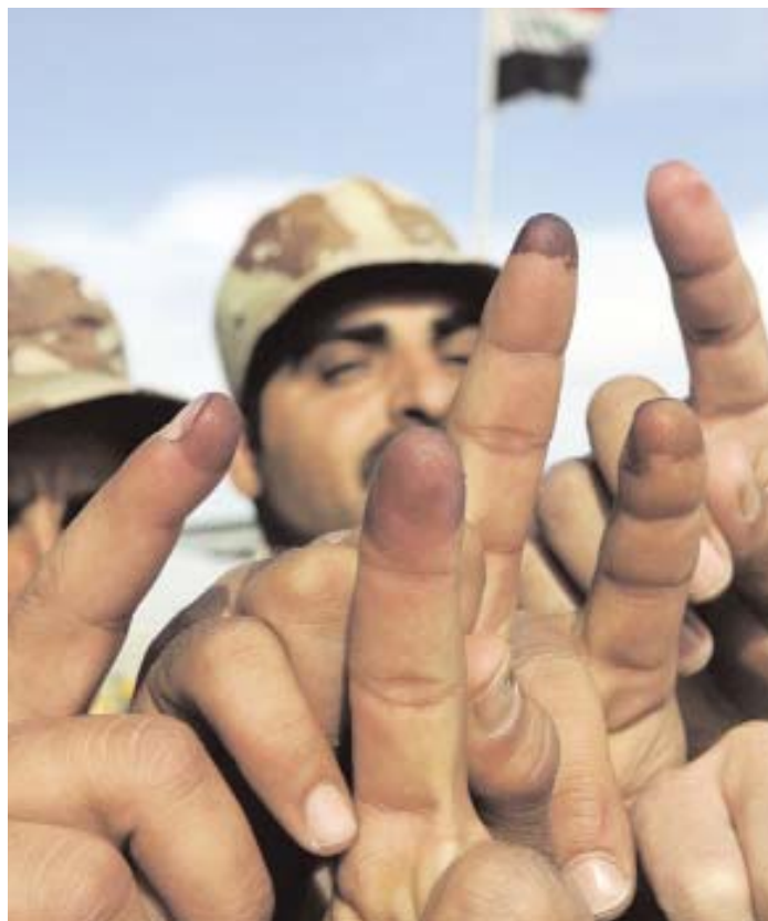
Iraqi soldiers prove they have voted by showing their ink stained fingers in the pre-election held in Iraq Dec. 12.

"The overall atmosphere was not as jubilant as the soccer victory over Syria Sunday night, but the mood was definitely positive," said one coalition force soldier who