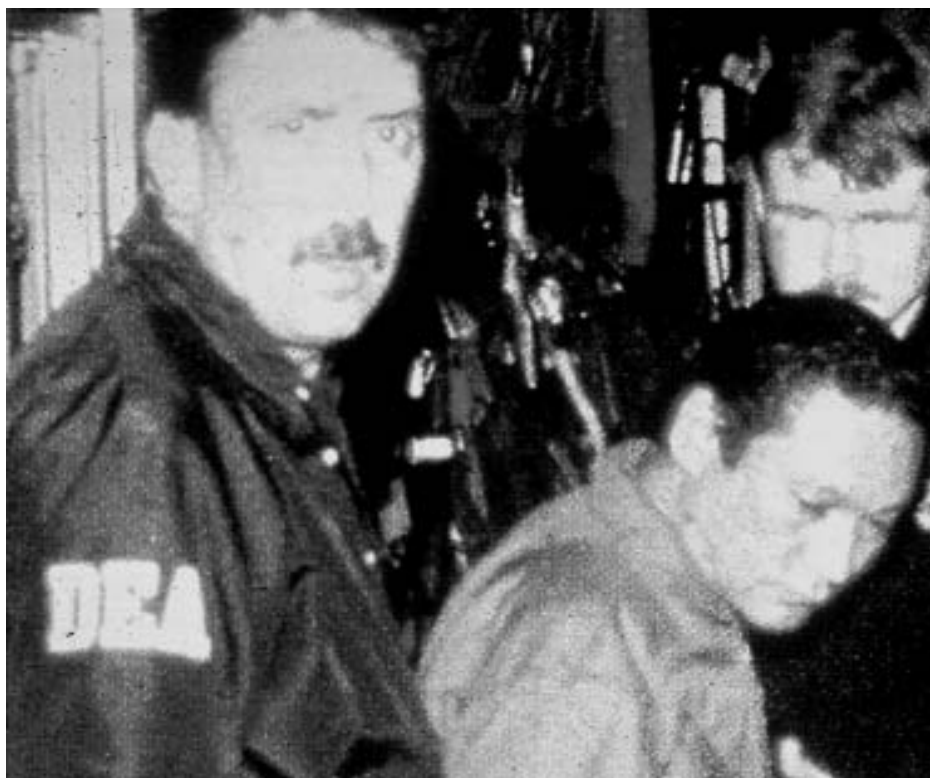
DEA agents take President Manuel Noriega into custody aboard an MC-130 aircraft. He was flown to Miami, Fla.