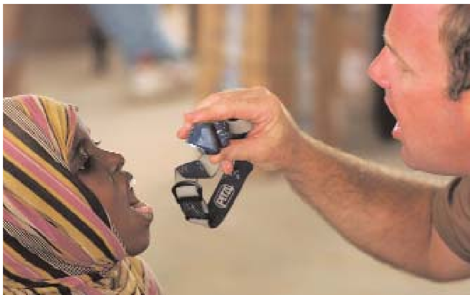
A Civil Affairs medic looks inside the mouth of a local child with the help of a light in Gode, Ethiopia. Military medical personnel from Combined Joint Task Force-Horn of Africa participated in a three-day medical civic assistance program providing aide to more than 2,000 Ethiopians.

“That’s my favorite part — seeing the children laugh, visiting with them and making them feel better,” the NCOIC said.