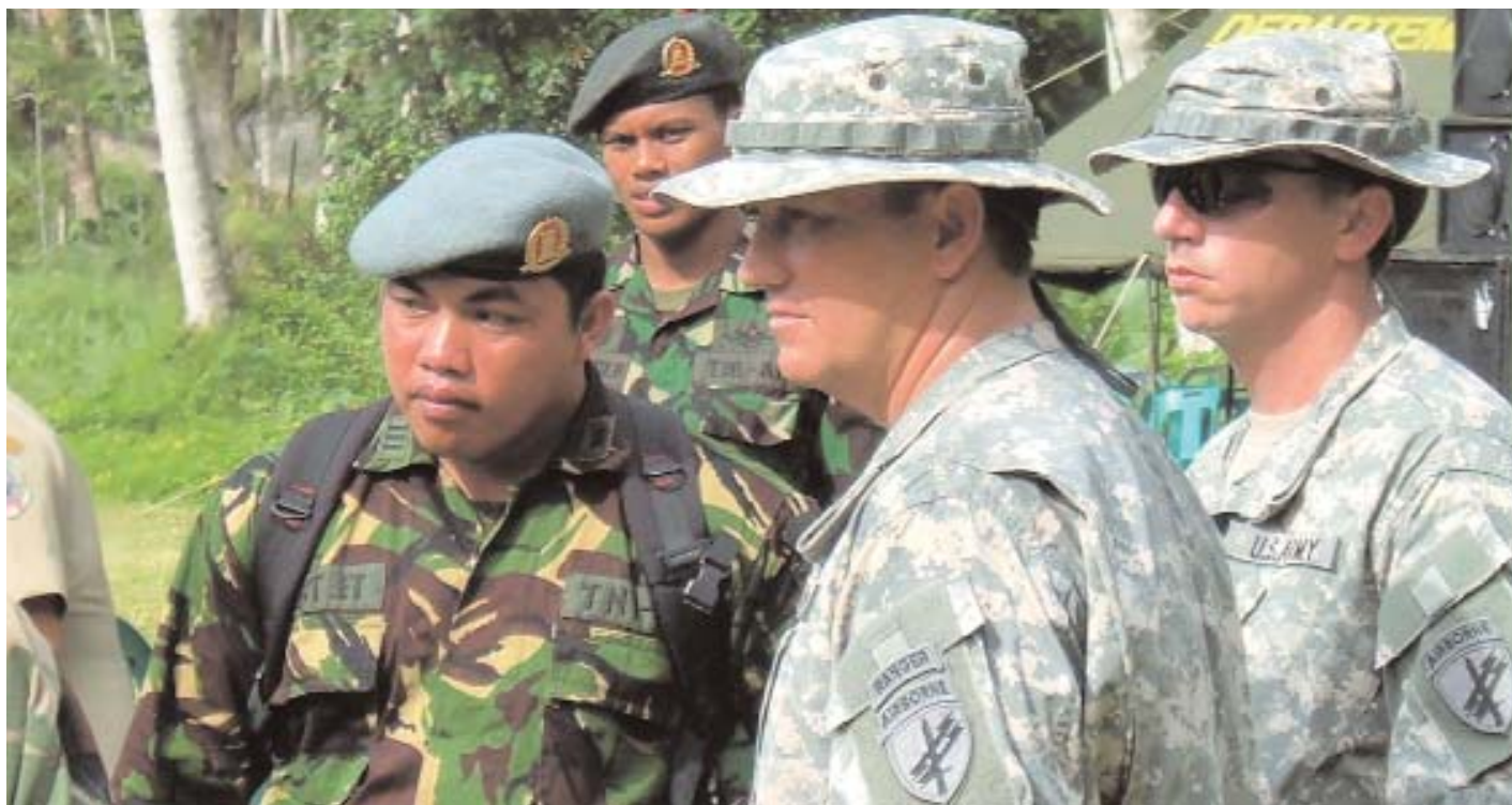
Civil Affairs Soldiers serving with Special Operations Command-Pacific, talk with members of the Indonesian Armed Forces at the start of an Engineering Civic Action Project (ENCAP) at Nias Island, Indonesia on Dec. 7. The U.S. is partnering with the Indonesian government to rebuild portions of Nias Island that were destroyed during a March earthquake. This is the first time the U.S. military has participated in an ENCAP on Nias Island. U.S. Pacific Command has allocated $1.3 million in humanitarian assistance funding for the projects, which are expected to take about four months to complete.