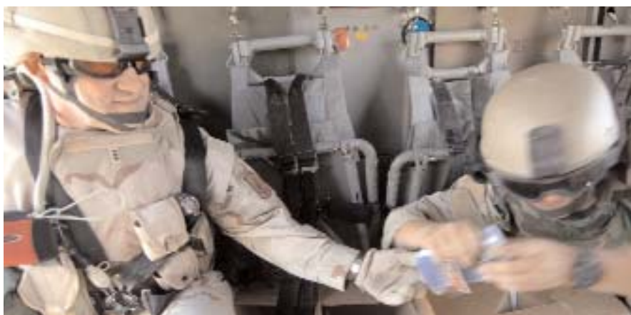
Psychological Operations drops leaflets on the villages of Shirin and Adam Khan, Afghanistan.

Let us also remember, 23 USACAPOC Soldiers have made the ultimate sacrifice for our nation and the cause of freedom.