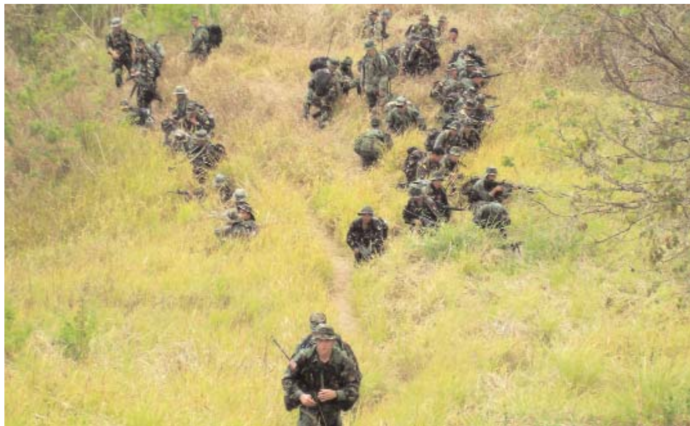
Special Forces and the Philippine Army’s Special Operations Command conduct a field exercise.

In Sulu, special operations troops are there to assist, advise, train and share information. Also, SOF were there to assess the preparation for civic action programs.