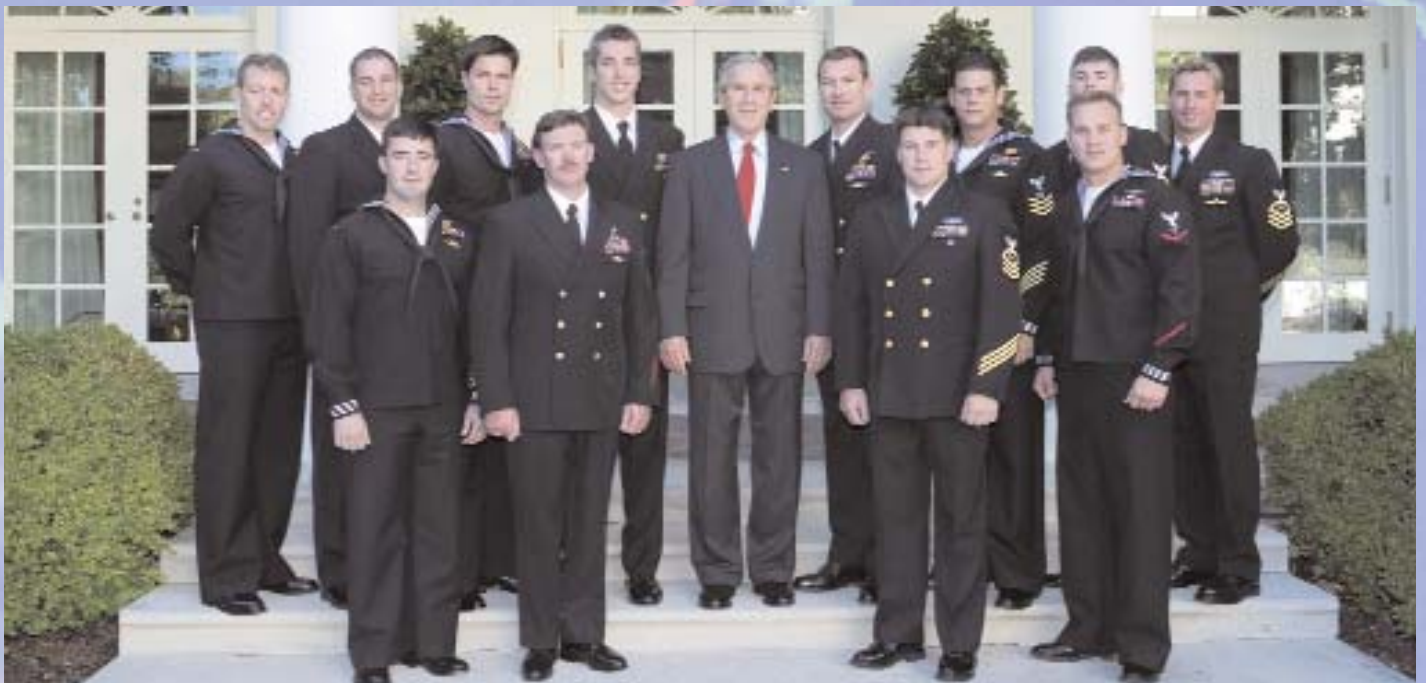
President George W. Bush poses for a photo with the U.S. Navy Parachute Team "Leap Frogs" outside the Oval Office. The Leap Frogs are comprised entirely of U.S. Navy SEALs and Special Warfare Combatant-Craft Crewmen.

The NPT performs aerial demonstrations at professional baseball games, football games, and air shows throughout the United States in support of the U. S. Navy, the Navy Recruiting Command, and the Naval Special Warfare community.