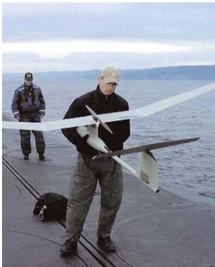
Airmen with the 22nd and 23rd Special Tactics Squadrons launch a Pointer unmanned aerial vehicle during an exercise aboard the USS Alabama.