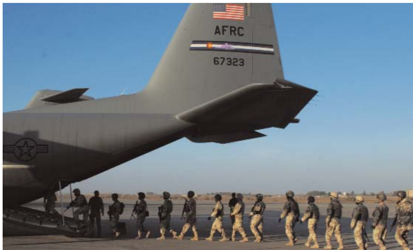
Soldiers from the Iraqi Army's Company C, 1st Commando Battalion, 1st Iraqi Special Operations Forces Brigade board a C-130 aircraft at Baghdad International Airport Dec. 2 en route to provide extra security in the Al Kut area in the weeks leading up to the Dec. 15 Iraqi general elections.

"As a soldier, it is my job to go where I am told, but I know serving in the army gives me a chance to help Iraqis and help Iraq," the corporal said. "Everything we do is all about working together and helping people."