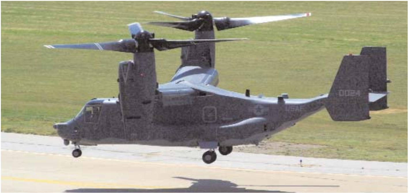
The CV-22 Osprey lands.