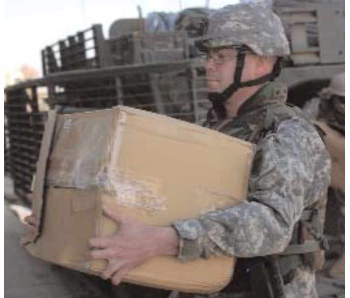
A 401st Civil Affairs Battalion Staff Sergeant helps carry school supplies into the Ninewa Middle School.

Operation Iraqi Children was co-founded by actor Gary Sinise and author Laura Hillenbrand in March 2004.