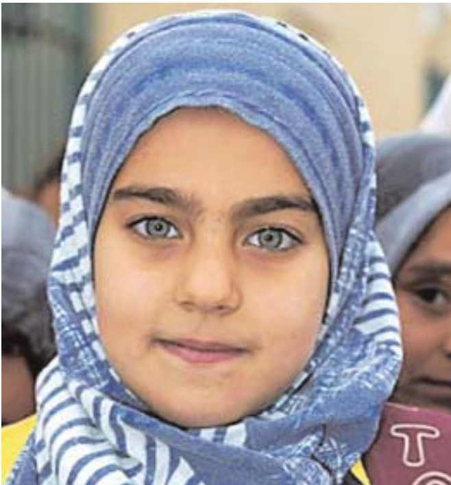
A student smiles for the camera after receiving new school supplies donated by Operation Iraqi Children.

The visit to the school also made him realize the tremendous morale boost the troops receive helping the kids, he said. "I saw a wonderful camaraderie between the Iraqis and Americans, and I wanted to support our troops in their effort to continue to build these relationships. It's all real stuff, and I saw it first hand and wanted to support that feeling. I saw what it did to the troops, the smiles on their faces, and how it made them feel to be at that school that day."