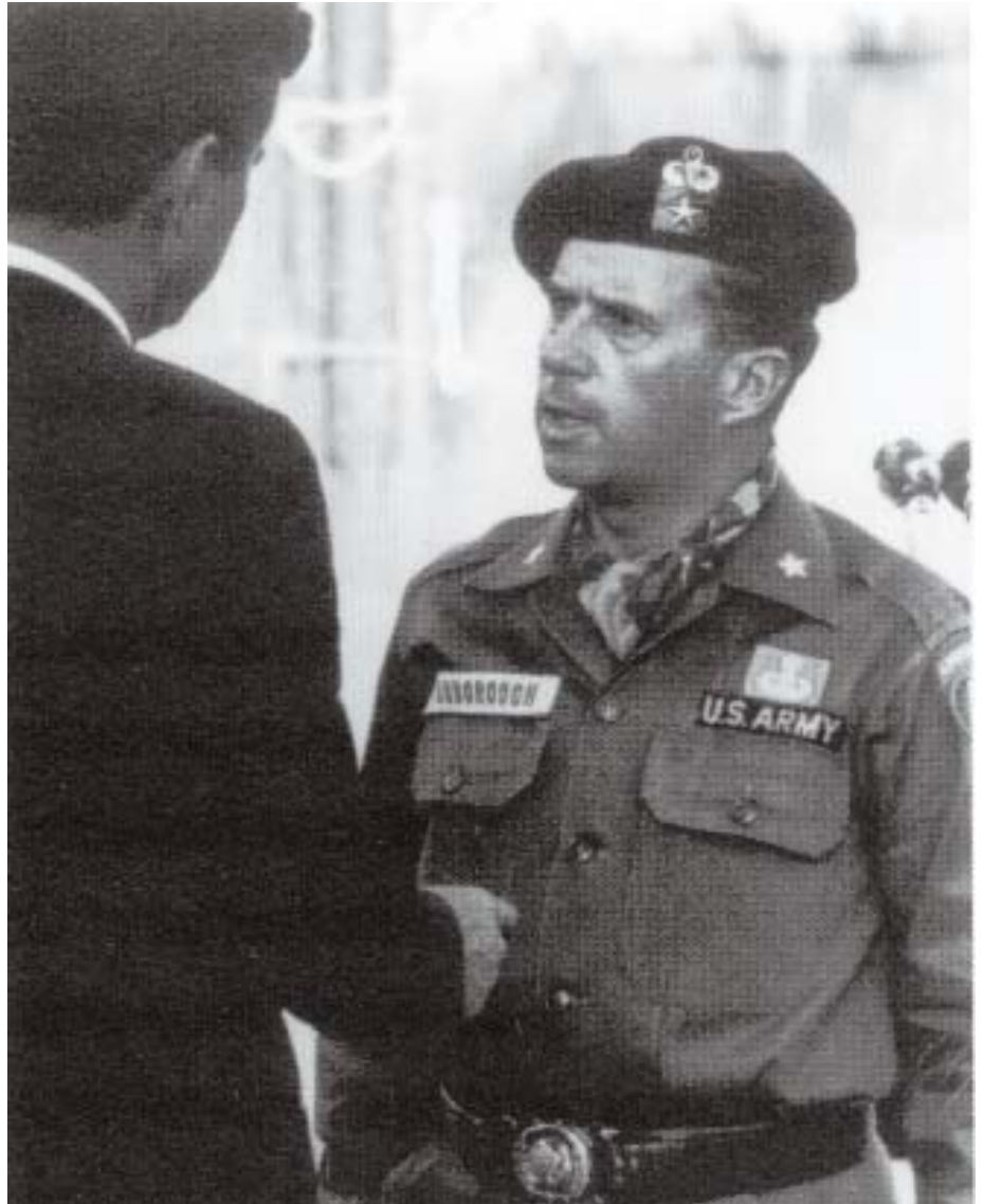
Lt. Gen. William Yarborough (right) meets with President John F. Kennedy at Fort Bragg, N.C., Oct. 12, 1961. Yarborough is credited as one of the founders of U.S. Army Special Forces.

In 1945, he was the Provost Marshal for U.S. Forces in Austria and the Vienna Area Command. There he organized the Four Power International Patrol of Russian, French, British and American military police.