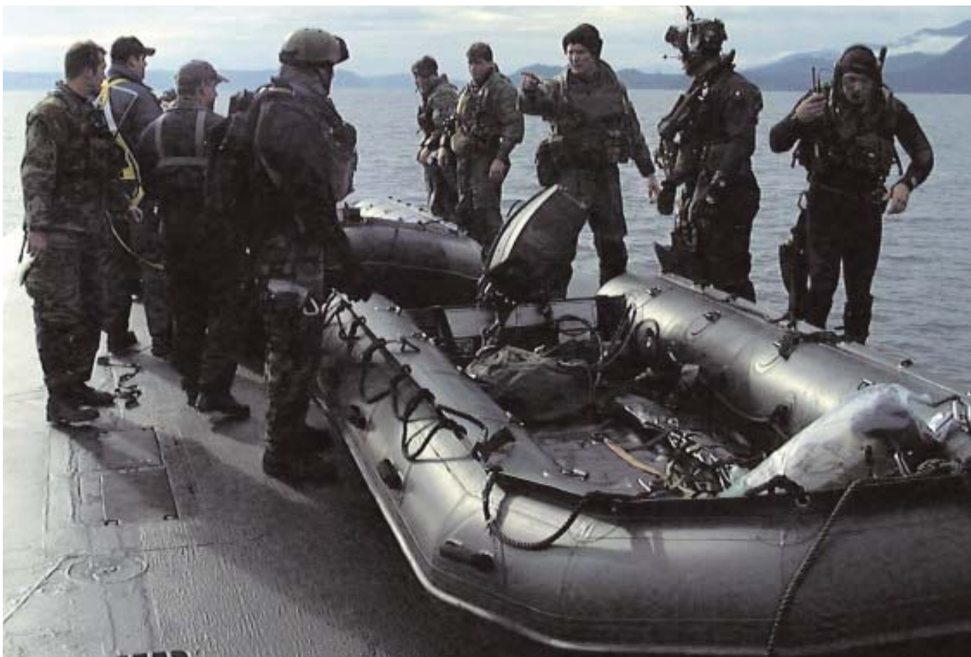
Airmen with the 22nd and 23rd Special Tactics Squadrons launch an inflatable boat from the USS Alabama into the Pacific Ocean during an exercise. The exercise tested special operations infiltration and rescue tactics. The joint effort also tested the capabilities of the Ohio-class ballistic missile submarines specially modified to carry SOF forces. The submarines are converted from ballistic missile submarines to guided-missile submarines with new capabilities.