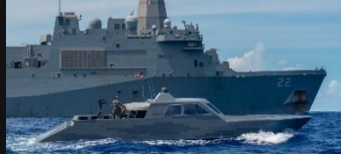
Maritime Precision Engagement