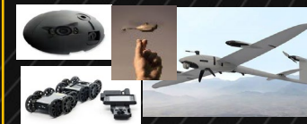
Hostile Forces Tagging, Tracking & Locating