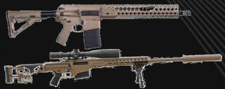
Ground Organic Precision Strike System