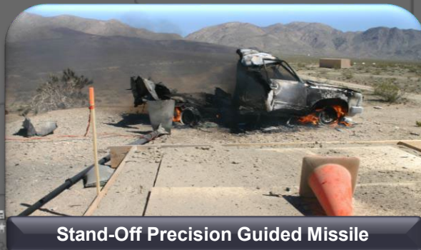
Stand-Off Precision Guided Missile