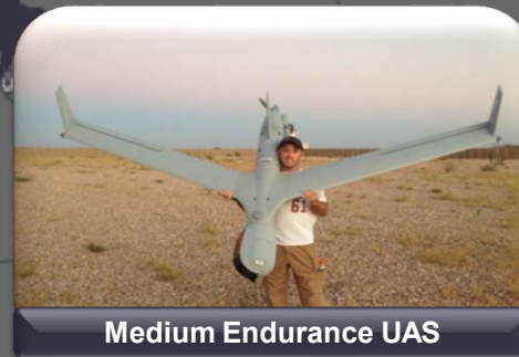
Medium Endurance UAS