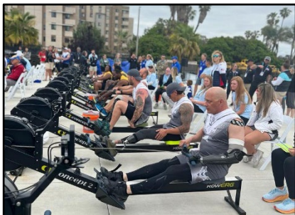
Team SOCOM Rowers give everything they got on the ERG