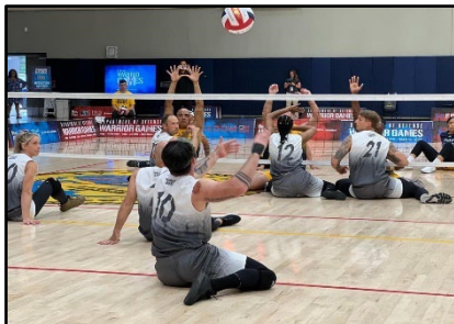
Team SOCOM takes on Team Navy in the Semi-Finals for the Sitting Volleyball Competition