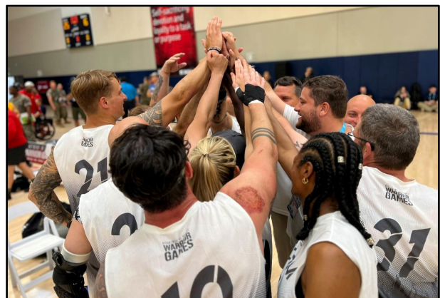
Team SOCOM Sitting Volleyball team celebrates after winning the Gold Medal at the 2023 DoD Warrior Games Challenge SEE MORE ON THE DWGC INSIDE