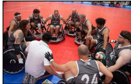
SOCOM Wheelchair Rugby Team in the huddle during the Wheelchair Rugby qualifiers