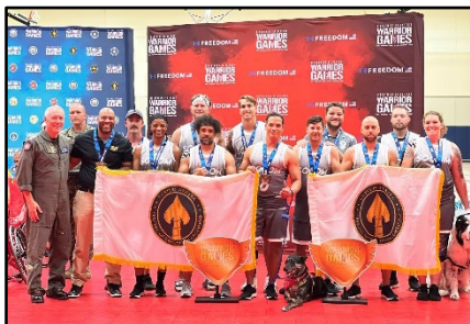
SOCOM Wheelchair Basketball Team takes a group shot after winning the Bronze Medal